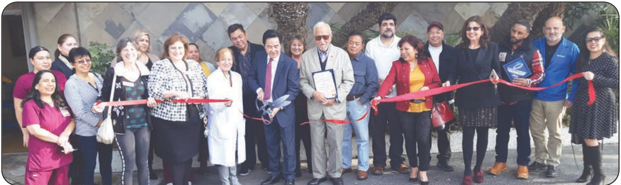
“Let the ribbon fly!” Stand back everyone the ribbon has been cut and “it’s a go” to honor Tender Care Community Clinic as they become our newest member.